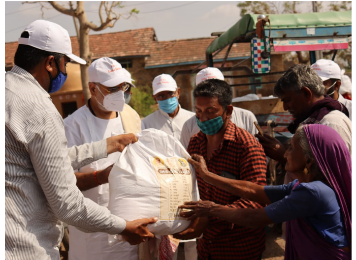
Pujya Bhaishri distributing grocery supplies during second COVID wave in rural areas.

Amazon Smile: Please remember to use the link smile.amazon.com/ch/27-0008548 for a portion of your Amazon purchases to be donated to Vidya Vikas Charitable Trust Inc.