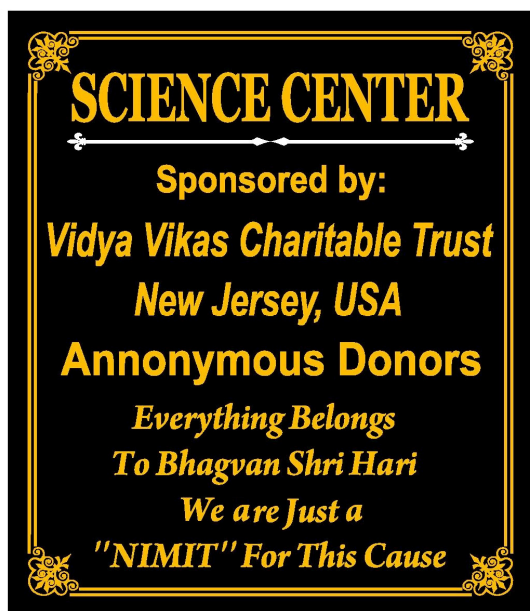
Saputara Science Center Plaque