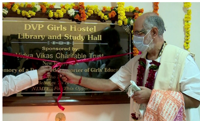
DVP Girls Hostel Plaque

In 2021, VVCT also lead Devka Vidyapith school girls hostel building renovation project. Under this project a new separate wing for girls was constructed. This wing has the capacity of more than 825 girls. The wing consists of dining hall, library, study hall, and girl's living quarters. Library has a capacity of storing 5000 higher education books. Study hall has capacity of 225 girls to sit at a time and do the study. This entire project is sponsored by anonymous donor with the donation of $150,000 dollars.