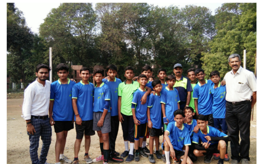
Akshar Trust: Students playing Holi, participating in Garba and playing football