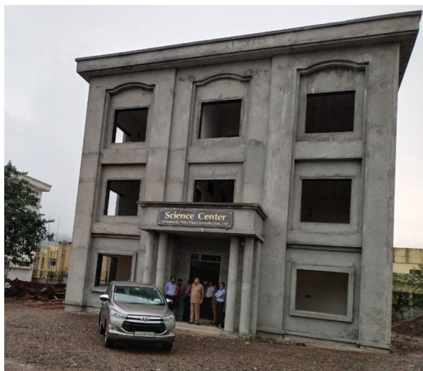
Saputara Science Center Building

VVCT was able to sponsor the building of Saputara Science Center with the help from an anonymous donor for a donation of $150,000. There will be 180 students using this facility. Saputara Science Center building consists of 3 floors.