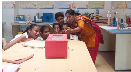
Science Lab at Akshar Trust

Akshar Trust, Vadodara, Gujarat, has been working as a charitable trust for hearing impaired children for the last 30 years. They provide education and care to hearing impaired children and guidance to their families. Conduct research, investigations and experiments in education of hearing impaired children. Train teachers of the hearing impaired. The endeavor of Akshar Trust is to enable children with hearing impairment to have a access to economic environment which will prove to be their opportunity, for a life of independence and self-dignity. Also make an individual with deafness lead a useful, happy and fulfilling life.