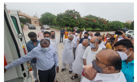
VVCT COVID-19 Emergency Relief