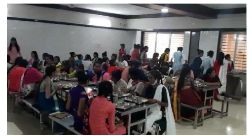
Devka Vidya Pith Girls Hostel Dining Hall