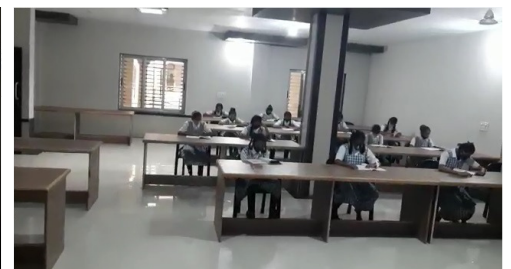
Devka Vidya Pith Girls Library and Study Hall

Considering the noble work being done by these schools for the education and uplifting of the children and their families, your support is very much appreciated.